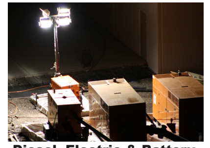
Diesel, Electric & Battery Powered Light Towers