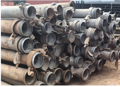
QD Piping, HDPE Piping, Hoses, & Fittings