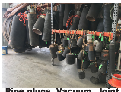
Pipe plugs, Vacuum, Joint & Mandrel Testers