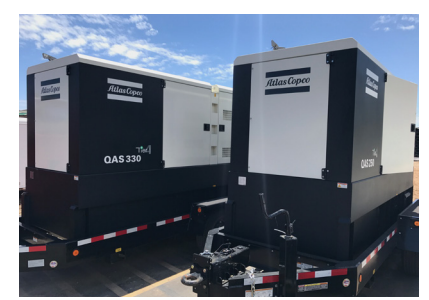
Portable & Standby Generators