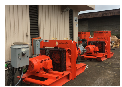
Electric Dri-Prime & Submersible Pumps