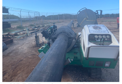
HDPE Fusion Equipment and Training